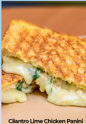
Cilantro Lime Chicken Panini