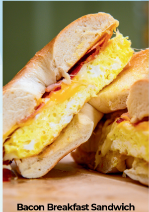
Bacon Breakfast Sandwich

A half sized power bowl filled with kale, quinoa, our house made eggs, cheddar cheese, green onions Szechuan chili crisp, and whipped cream cheese.