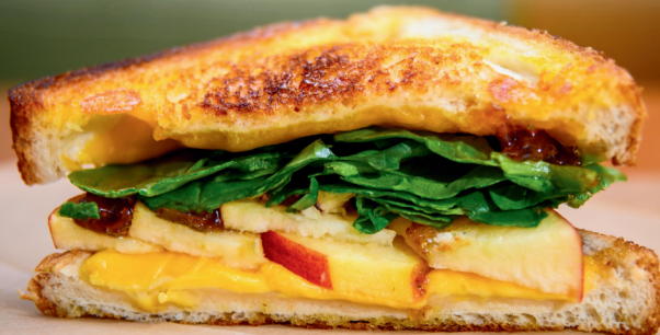
Apple Fig Grilled Cheese

Soft butter croissant stuffed with house made chicken salad, cheddar cheese, lettuce, tomato, and a smokey honey mustard.